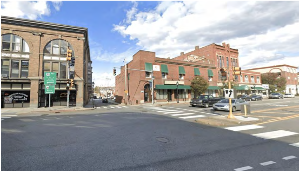
The intersection of Main and Moody Streets.

The Waltham Times published an article on Jan. 4 reviewing crash data from MassDOT. One thing not covered in that article was where Waltham sits in relation to other Massachusetts cities with regards to the safety of our streets. According to MassDOT's Interactive Crash