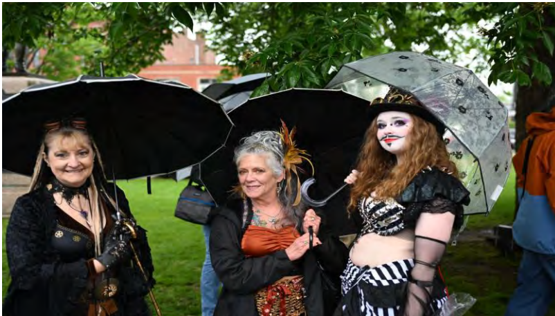
Waltham's Steampunk Festival was one of the recipients of the WCC grant.

Many of the grants issued this year support community events such as Waltham RiverBeat, Watch City Steampunk Festival, Concerts on the Common and Farm Day.