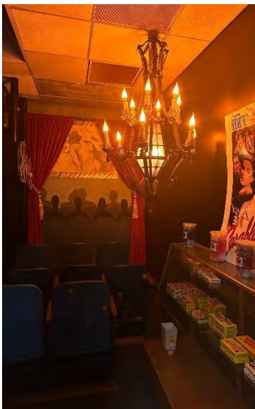
The Embassy Theater exhibit with original chairs and a chandelier.