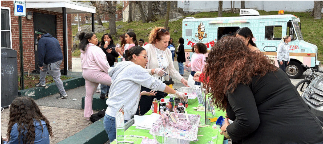
A table hosted by the Waltham Public Library offered an art project making prints from paint swirled with shaving cream.

Children and teens milled around outside the Prospect Hill Community Center on Wednesday afternoon when an ice cream truck pulled up. Instantly, the amorphous crowd formed into a tidy line. Ice cream cones were distributed with impressive efficiency. Towering stacks of pizza boxes arrived soon after. Student volunteers from Bentley University handed out cheesy slices.