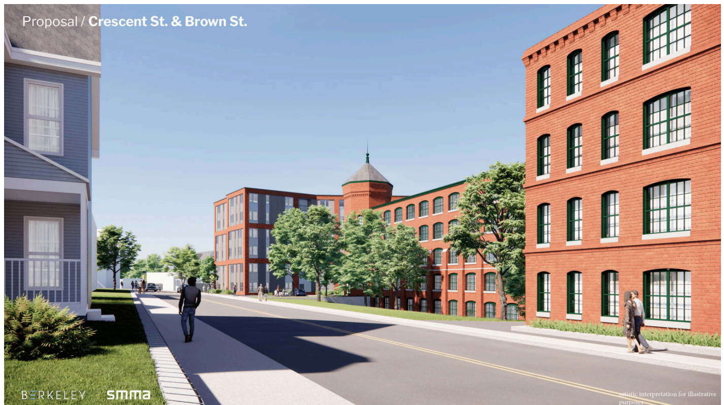
An earlier version of the Watch Factory architect's rendering.

Since the first community meeting in 2022, the developers' plans have been approved by the Traffic, Historical and Conservation commissions and the Municipal Affordable Housing Trust. Developers will next seek approval for special permits from the Zoning Board of Appeals and City Council.