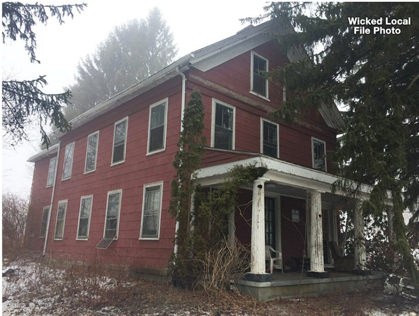
Cardinal Cottage prior to its exterior renovation.

Waltham has acquired a comprehensive permit to operate Cardinal Cottage, a historic building on the site of the former Fernald State School , as two units of affordable housing.