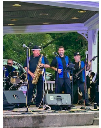
The Watch City Cadillacs performed during 2025’s summer Concerts on the Common series, run by the Waltham Arts Council. The nonprofit and the music series celebrated their 50th anniversary in 2025.