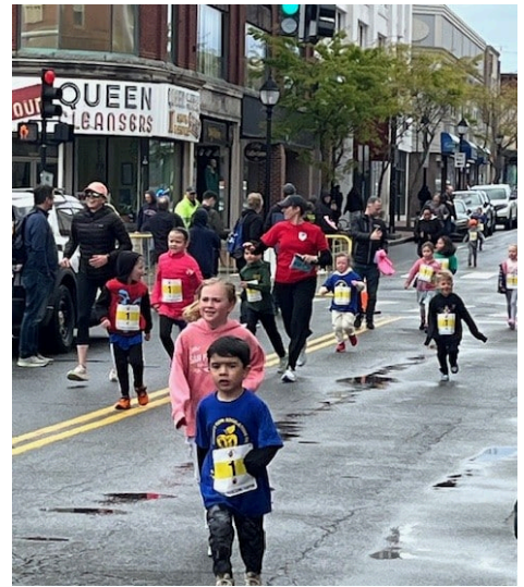
K-3 runners charge toward the finish line in the 1K race.