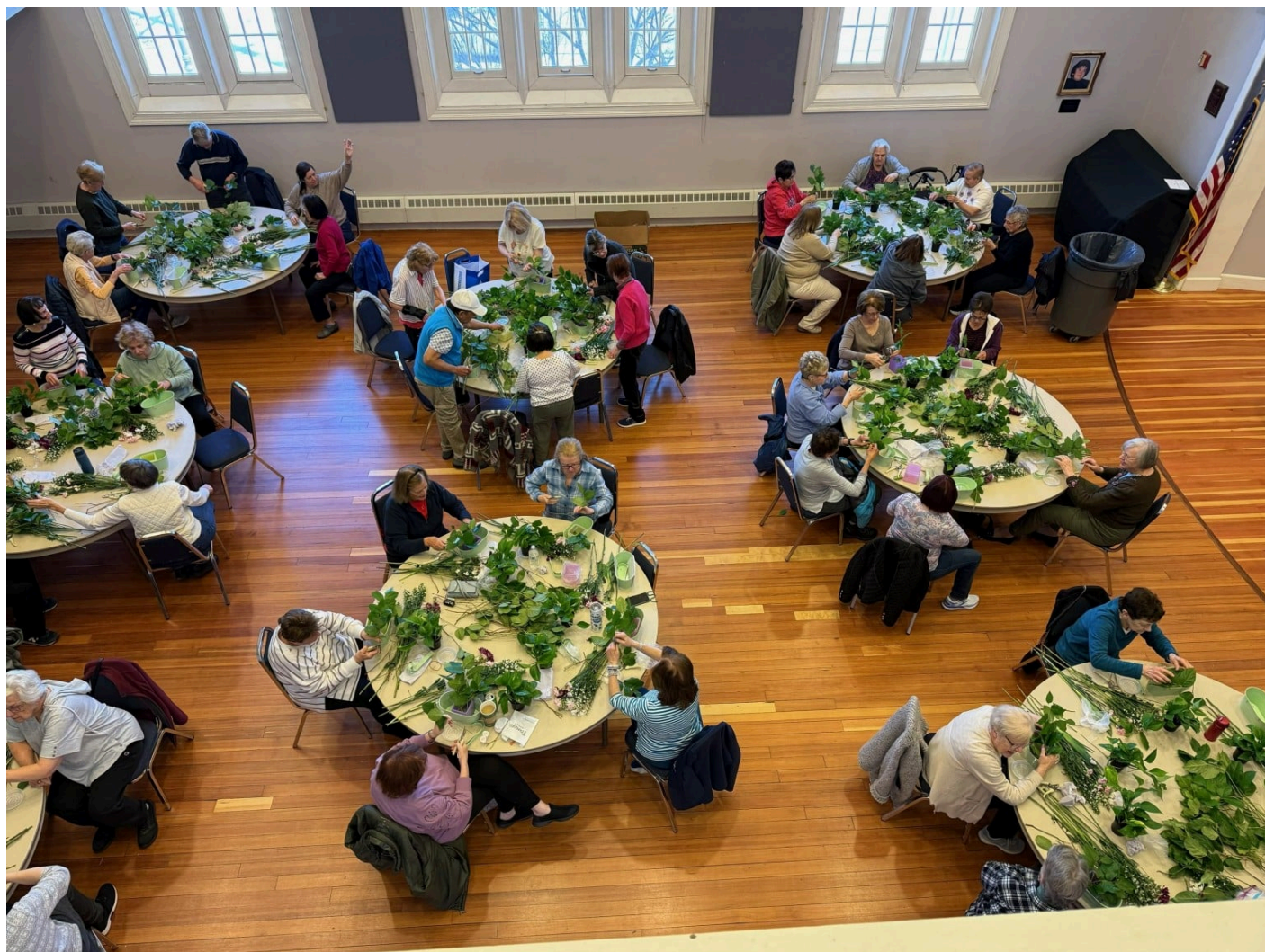
Waltham seniors participate in the flower arrangement workshop.

Last week, more than 50 seniors gathered in the auditorium at the Stanley Senior Center for “Flowers with Ernie,” a hands-on workshop where participants created a planter for Mother’s Day.