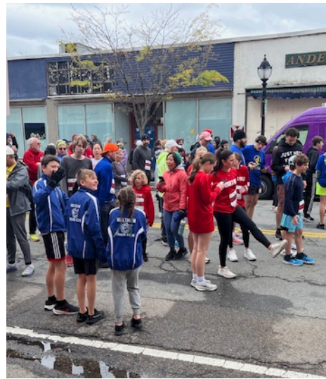
Runners line up at the starting line for the WEBF 5K.